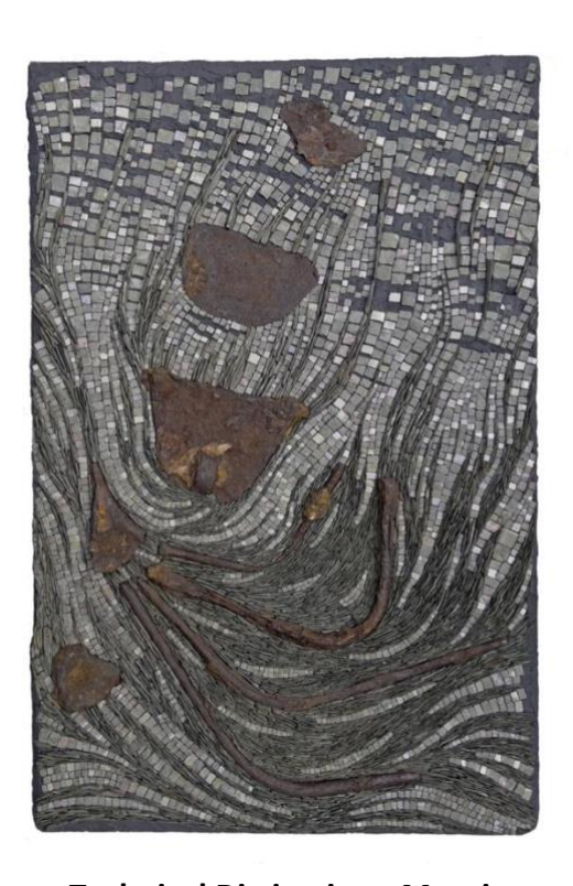
Technical Distinction - Mosaic Todd Campbell, "Time and Tide No. 8"