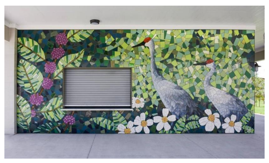
Best Site-Specific or Architectural Project Cherie Bosela, "Natural Florida"